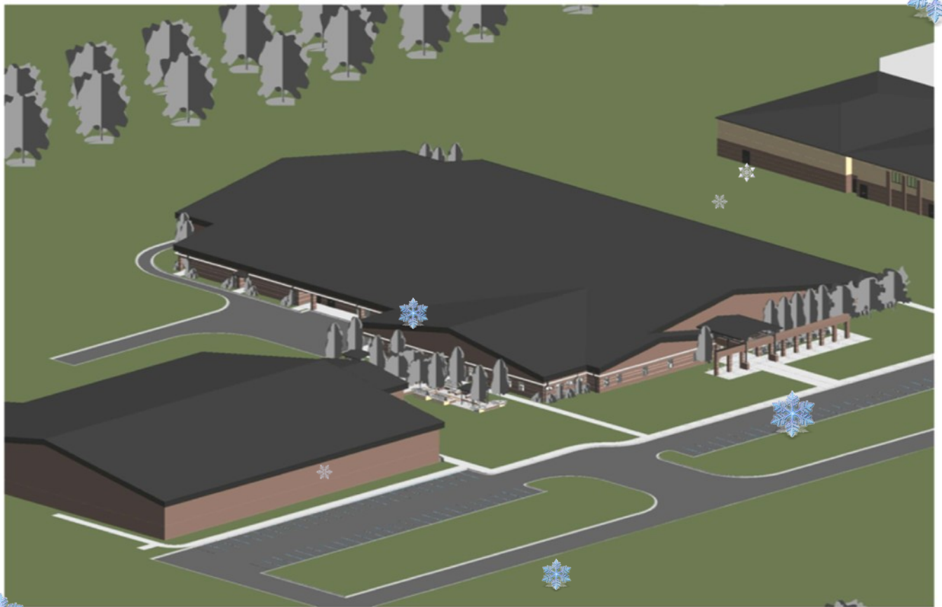
Maneuver Battle Lab, Fort Benning, Georgia - see pg. 2 for details